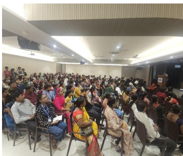
Free Legal Aid Awareness