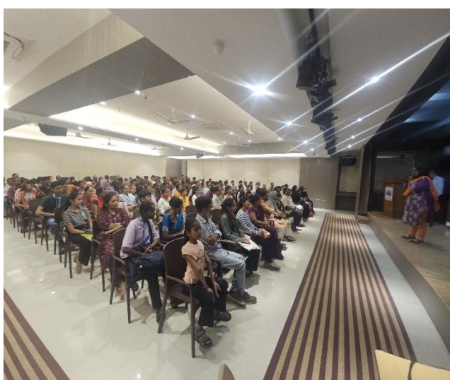
Session on "Justice Through Gandhian Philosophy"