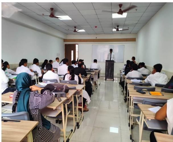
Guest session on Rights of Transgender